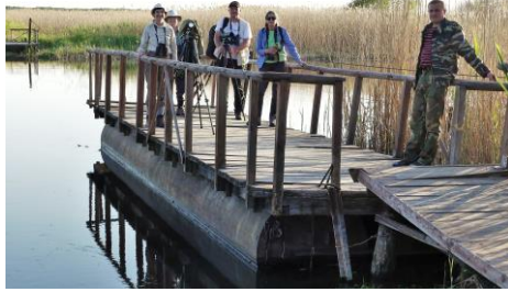
Local transport, Sporovo Reserve

where we were treated to close views of a pair of Eurasian Penduline Tits. Later, after a brief stop at our hotel we visited the Sporovo Reserve - an extensive area of wet grassland and reedbeds along the Yaselda River which is one of the European strongholds of the 'vulnerable' Aquatic Warbler. In the reedbeds we had great views of Citrine Wagtail, Bluethroat, Sedge Warbler and Whinchat. Most surprising of all was a Corncrake which responded to playback and repeatedly flew up out of the vegetation and even joined us on the boardwalk!! As the light faded, we looked over the wet grassland known to be favoured by the Aquatic Warbler and saw a bird perched and also in flight but were unable to make a positive identification.