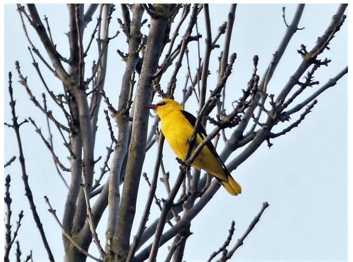
Eurasian Golden Oriole

The following morning after an excellent breakfast we set off on the 4 hour drive south to the Pripyat National Park and our comfortable hotel in Turov. Along the way we saw our first Harriers; Marsh, Hen and Montague's drifting overhead. The hedgerows produced the first sounds of Thrush Nightingale and Golden Oriole, sounds that would follow us throughout our journey. Two Hawfinches also showed well.