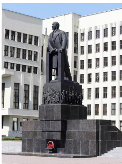
Statue of Stalin in Minsk

The four participants of the inaugural tour of Belarus arrived in Minsk, the capital, in the days prior to the start of the tour and spent some time exploring the wide avenues, parks, museums and memorials of the city. This was a pleasant diversion and a chance to experience the different culture of this former Soviet Republic.