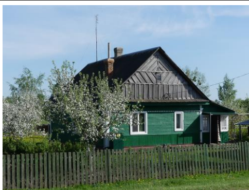
Traditional wooden cottage, Liadziec

Later we visited an area of open meadows and mixed woodland near Liadziec, an attractive village with many original wooden cottages still in good condition. Black Storks, Lesser Spotted Eagle and Northern Goshawk were seen at a distance. A pair of Great Grey Shrikes