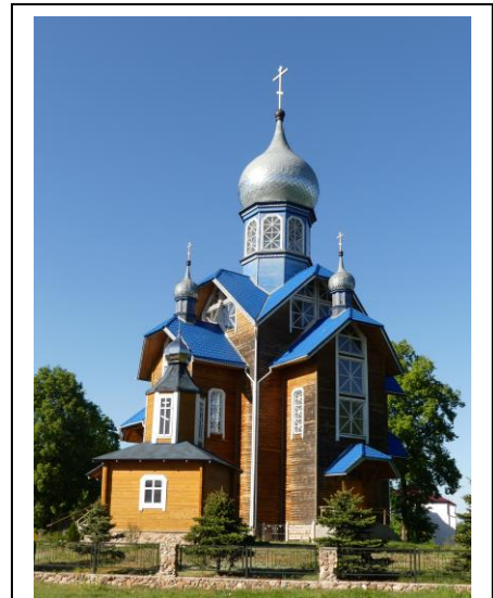
Orthodox Church, Sporovo

Overall we felt safe during our journey around this Eastern European country that still retains close links with its large neighbour, Russia. We shared lots of wonderful experiences, saw some amazing wildlife and thoroughly enjoyed our time there.